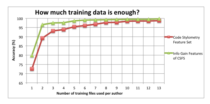
Figure 4: Training Data

length in implementing the same functionality. On the other hand, the average line of code of the 7 easier (76 LOC) or difficult problems (83 LOC) taken from contestants that were able to complete 14 problems, is higher than the average line of code (68) of contestants that were able to solve only 7 problems. This shows that programmers with better skills tend to write longer code to solve Google Code Jam problems. The mainstream idea is that better programmers write shorter and cleaner code which contradicts with line of code statistics in our datasets. Google Code Jam contestants are supposed to optimize their code to process large inputs with faster performance. This implementation strategy might be leading to advanced programmers implementing longer solutions for the sake of optimization.