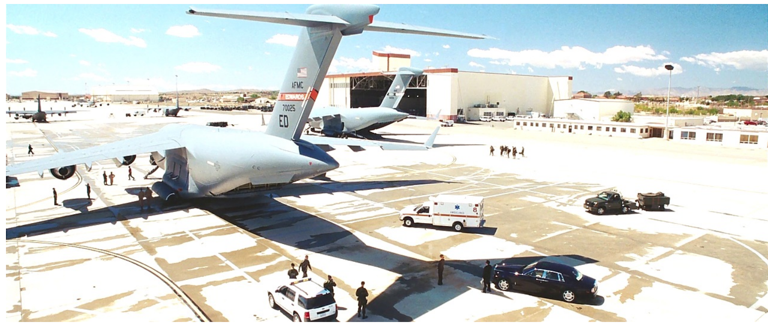
One of several scenes for Iron Man filmed at Edwards Air Force Base

It seems that any reference to military suicide—even an off-hand remark in a superhero action-comedy adventure—is something the DOD's Hollywood office will not allow. It is understandably a sensitive and embarrassing topic for them, when during some periods of the ever-expanding and increasingly futile 'War on Terror', more US servicemen have killed themselves than have died in combat. But why shouldn't a movie about a man who builds his own flying suit of armour not be able to include such jokes?