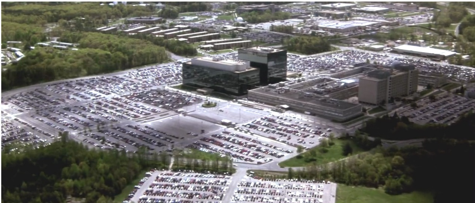
NSA headquarters at Fort Meade— Enemy of the State

This idea of using cinema to pin the blame for problems on isolated rogue agents or bad apples, thus avoiding any notion of systemic, institutional or criminal responsibility, is right out of the CIA/DOD's playbook.