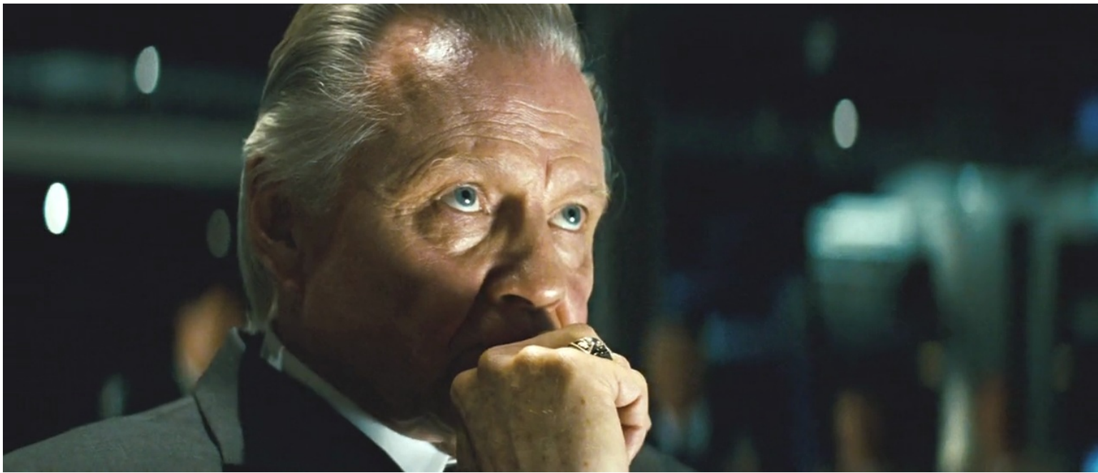
Jon Voight in Transformers —in this scene, just after American troops have been attacked by a Decepticon robot, Pentagon Hollywood liaison Phil Strub inserted the line ‘Bring em home’, granting the military a protective, paternalistic quality, when in reality the DOD does quite the opposite.

Alongside the massive scale of these operations, our new book National Security Cinema details how US government involvement also includes script rewrites on some of the biggest and most popular films, including James Bond, the Transformers franchise, and movies from the Marvel and DC cinematic universes.