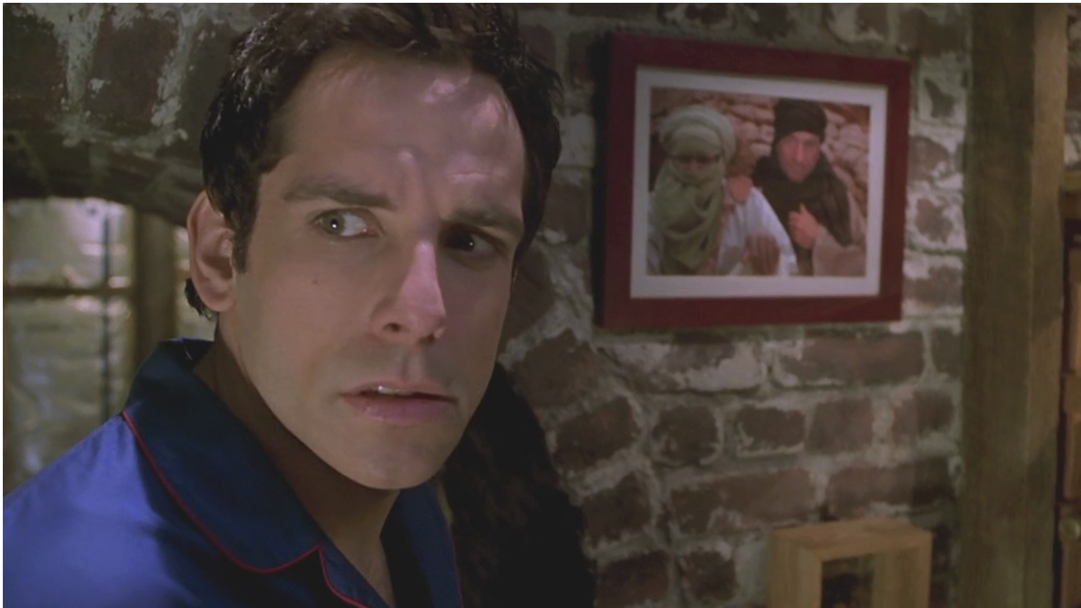
Ben Stiller discovers that Robert De Niro is working for the CIA — Meet the Parents