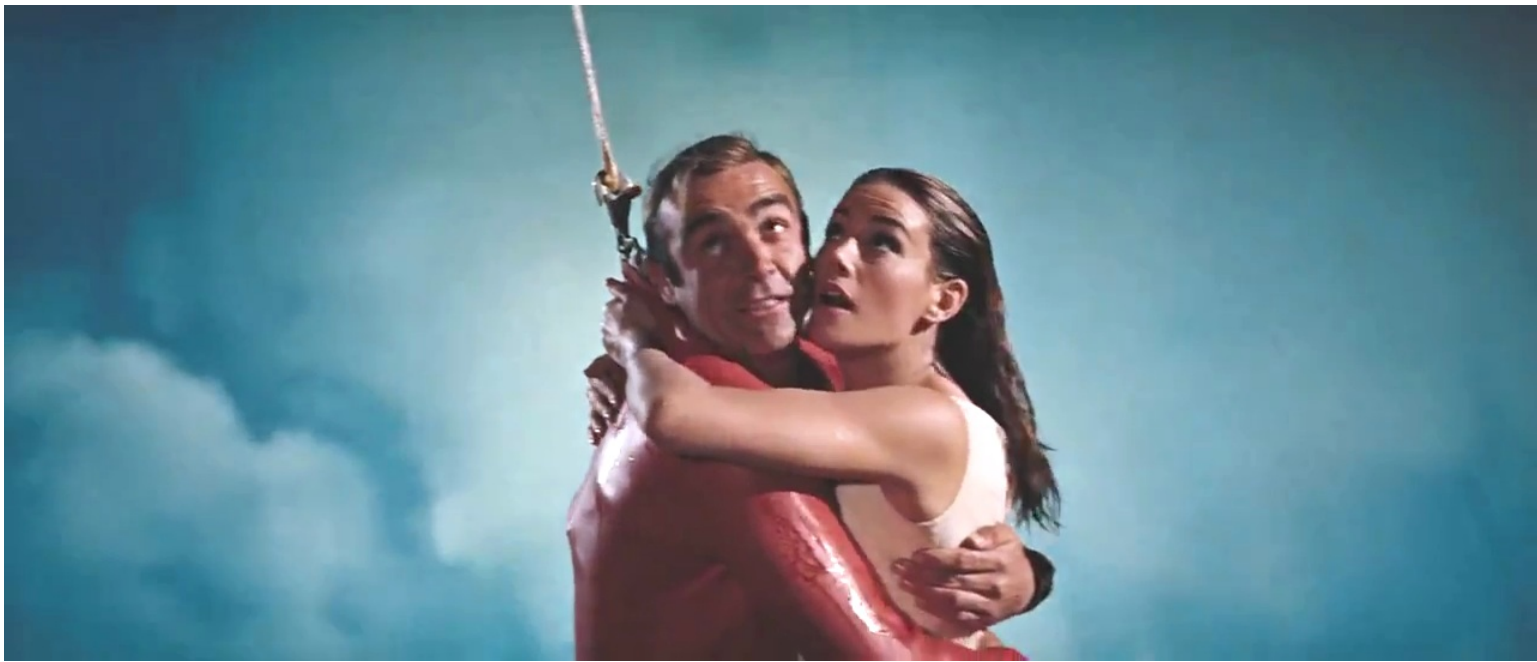
James Bond and Domino are rescued via a plane and skyhook that was loaned to the production by CIA front company Intermountain Aviation—Thunderball